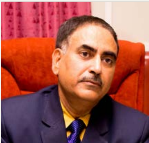
EDITOR IN CHIEF